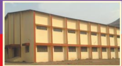
Indoor Sports Hall