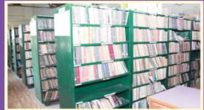
Library & Information Centre